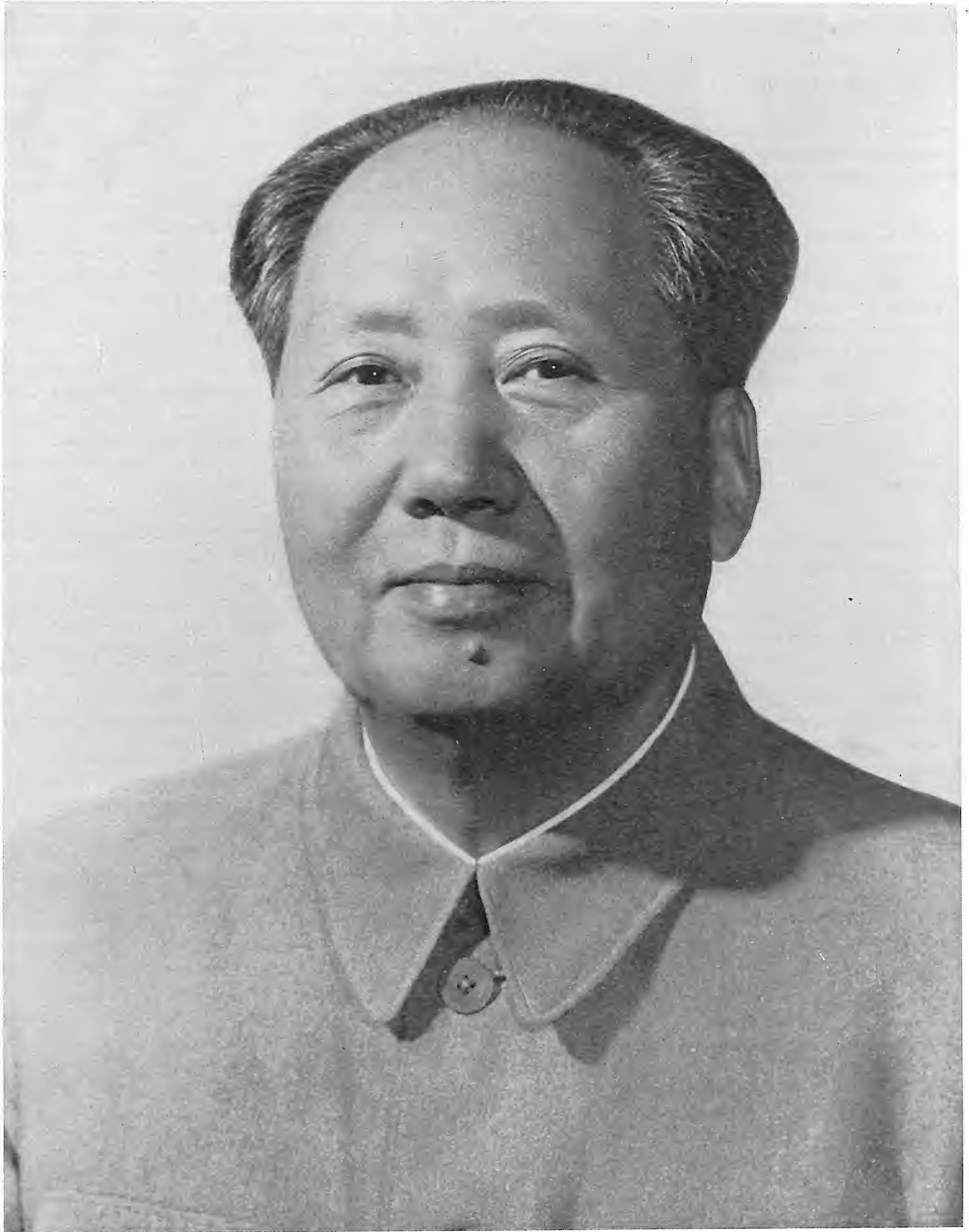
Chairman Mao Tsetung, great leader of the Chinese people.